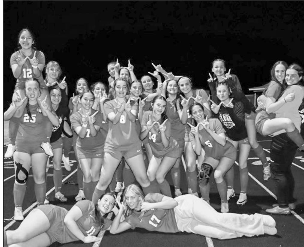
The Towns County Lady Indians celebrate their PK shootout victory over Banks County on Monday,

p.m. on Friday, March 7. The next home game is