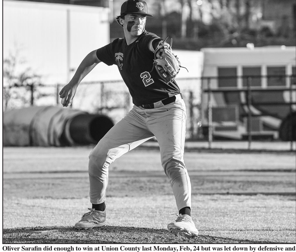
baserunning miscues.

After the game, the coaches got together and played each member of the team so that